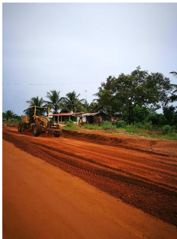
Road rehabilitation, Yana Tumakova

Human resource development has taken place not just within the ministries, but also in small and medium-sized enterprises.